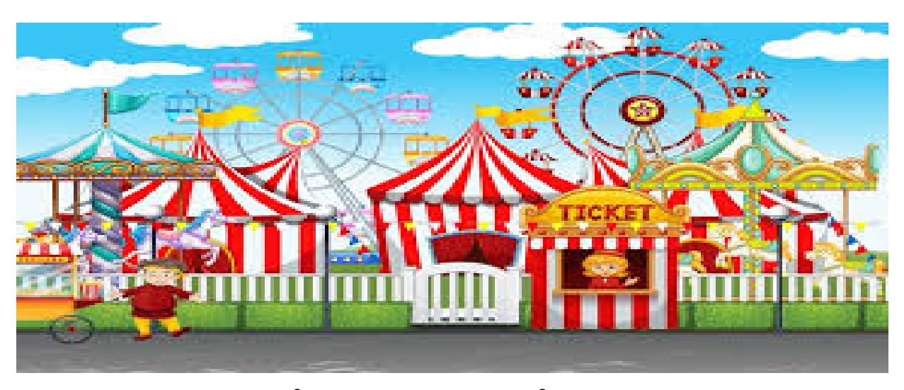
Midway Carnival Open Daily Noon-11:00 PM